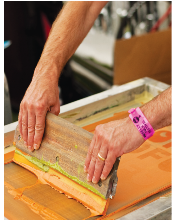
above: Screen printing in action below: Big Boom Theory , James Huizar, Serie XVIII (2011)